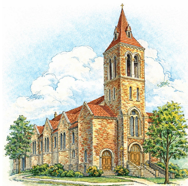
Parish Established 1910 Church Blessed 1927

Final expenses: $201,162.60 Still to pay: $170,592.6