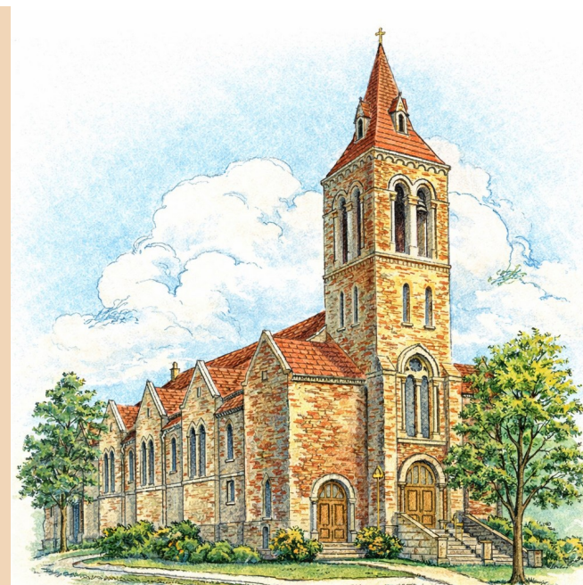
Parish Established 1910 Church Blessed 1927

• Fasting and abstinence are obligatory on Ash Wednesday and Good Friday . Fasting is required for those between the ages of 18 and 59 and allows for one full meal and two smaller meals that together do not equal a full meal. Abstinence from meat is required for those 14 years of age and older . All Fridays of Lent are days of abstinence from meat. While all Fridays are penitential days, in Canada, Catholics may substitute special acts of charity or piety for abstinence outside of Lent. Those who are ill, pregnant, or nursing are exempt from these obligations.